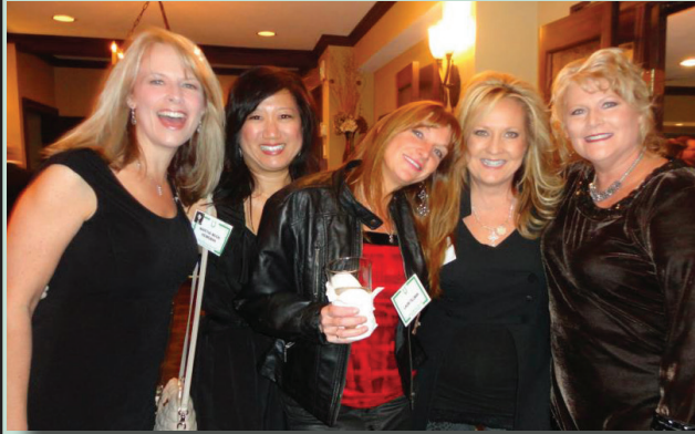
30th Reunion Class of 1982